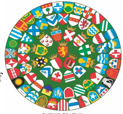
Kunsilli Lokali - Malta u Għawdex Local Councils - Malta and Gozo

An Annual Public Locality Meeting for Ghasri residents as per terms of the Local Council Act No. XV of 1993.70(1). The meeting will be held at the Ghasri Local Council Hall, 6 Dun Karm Caruana Street, Ghasri on Friday 18th June at 7:00 p.m.